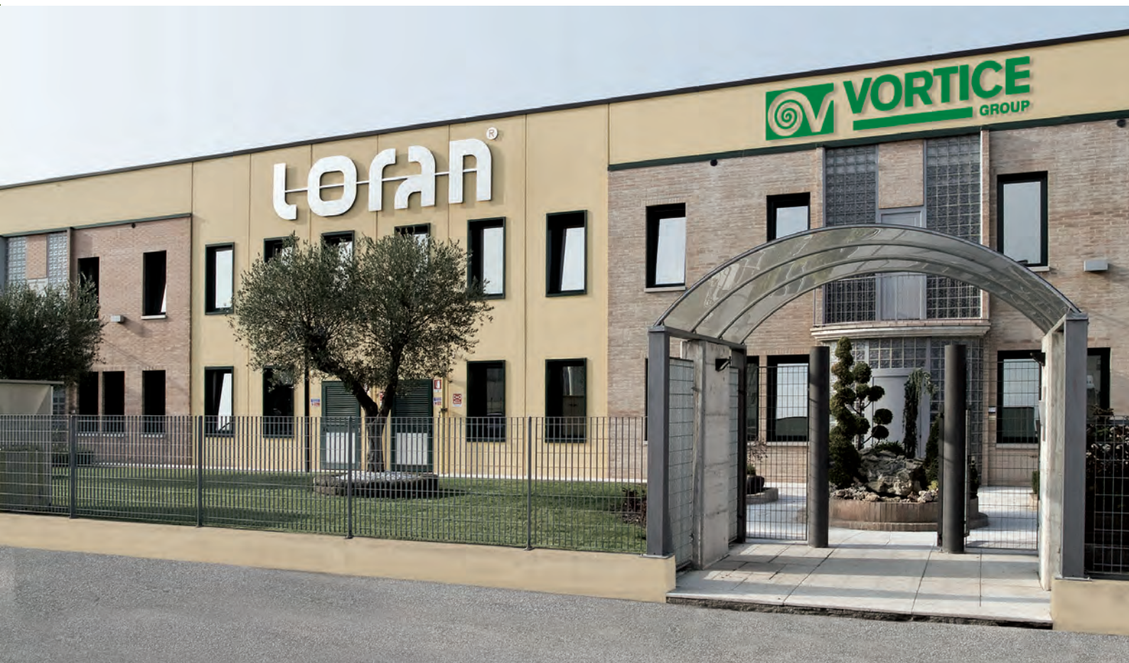
In the industrial area of Isola della Scala, in the province of Verona. Surface: 12.000 m 2 Production unit: 6.000 m 2